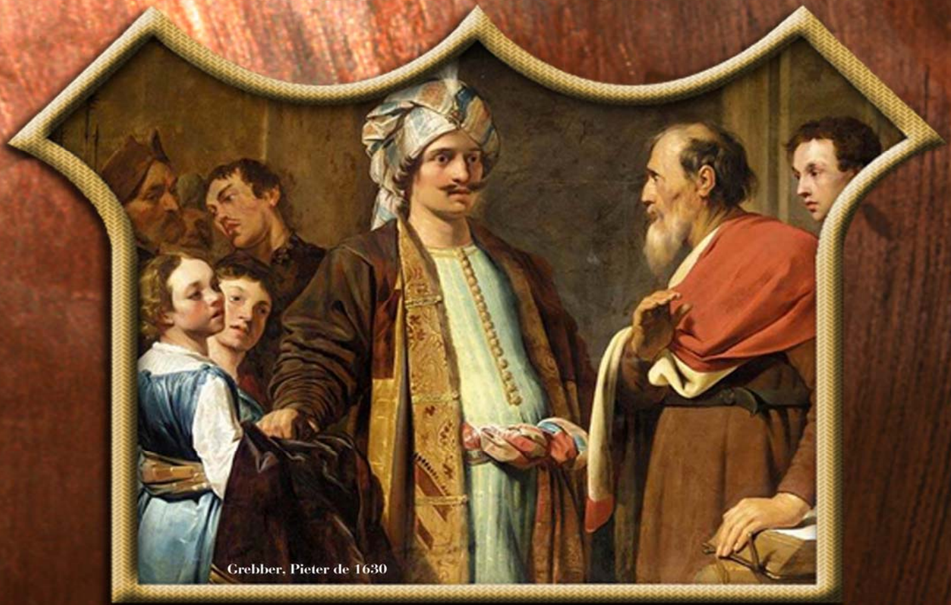
Grebber, Pieter de 1630